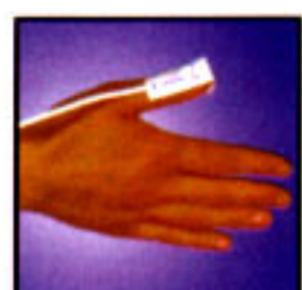
Adult (patient weight >30 Kg)