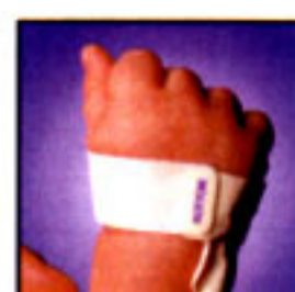
Neonate/ Multisite (Neonatal >3 Kg, Adult >40Kg)

A & P Cable length is 45cm (17.7 inch) C & N Cable length is 90cm (35.4 inch)