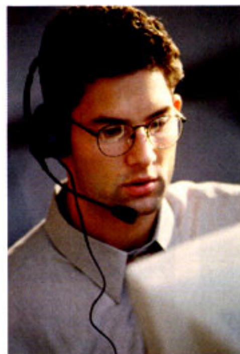
Convenient and professional Customer/Technical Support

Ask your sales associate about institutional and volume discounts. Not all products are available in all areas.