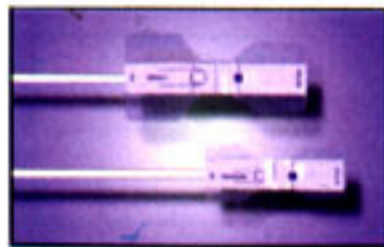
Transpore™ Best inspection (Transparent tape)