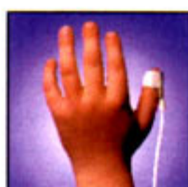
Child / Infant (3 to 22 Kg)