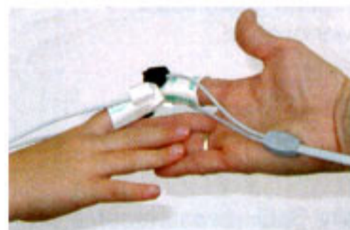
Adult and Pediatric

An innovative, economical solution for precise, fast and convenient SpO 2 measurements. The SensAid™ system is compatible with most of your popular monitors. It features a high quality reusable probe (see order table for monitor compatibility) and a disposable tape. The tape is latex free and comes individually packed in 3 sizes: Adult, Pediatric and Neonatal/Multisite.