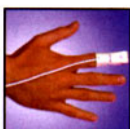
Pediatric (9 to 50 Kg)